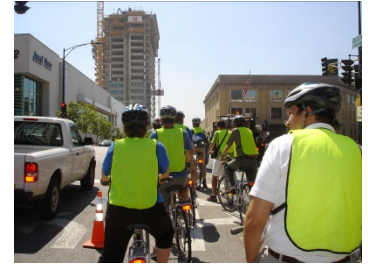
Midwestern District and Urban Streets Symposium conference attendees on a bike tour of Chicago

The College Edition Facebook page recognizes the achievements of third, fourth and fifth year engineering students and provides a forum where students can communicate with the Foundation throughout the year. The page also provides a source of academic and professional development opportunities available to them from National Engineers Week Foundation's engineering association, university, and corporate partners. Students can meet with their engineering peers in every field and learn about other events, licensure exams, internships, jobs, competitions, engineering associations and more.