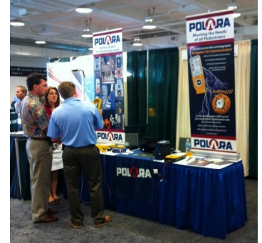
The Polara exhibit in the Exhibit Hall at the ITE Annual Meeting in Atlanta