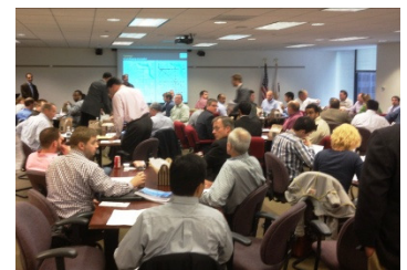
The Complete Streets Policies and Procedures workshop played to a full house