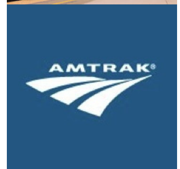
Current Amtrak trainsets including two bi-level versions