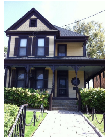
Martin Luther King, Jr.'s childhood home just east of downtown Atlanta