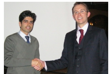
The 2011-12 Best Student Chapter award is presented to the chapter from the University of Illinois Champaign Urbana