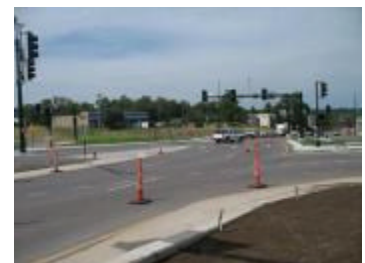
The south intersection at the I-270 - Dorsett Road DDI. Watch the U-Tube explanation at http://www.youtube.com/watch?v=YmIexcOxZM