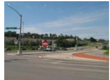
Downstream signals along the north-east leg of the Missouri 30 intersection channel left turn traffic to a parallel road and signal controlled intersection at Summit Drive. It's all explained on a MoDOT webpage at http://www.modot.org/stlouis/links/ContinuousFlowIntersections2.htm