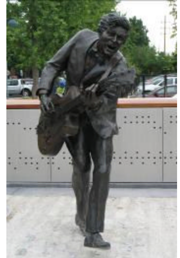
Chuck Berry immortalized as a streetscape element at a plaza along the Delmar Loop