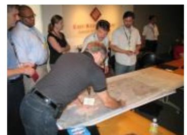
Four participants take a crack at developing a Streetscape master plan at the East-West Gateway