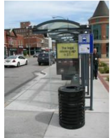
New street furniture along South Grand Boulevard. Decorative street lights are part of the final installation

Most interesting of all was the Innovative Intersection tour. Again three stops were made, one at a J-Turn in a rural setting along a higher speed route, one at a (modified) Continuous Flow Intersection, and one at a Diverging Diamond Interchange, both in suburban settings.