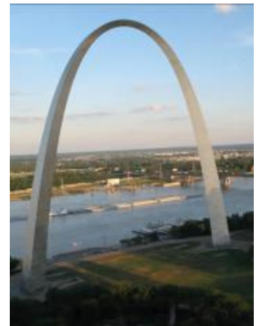
Mississippi River barge navigates past the Gateway Arch