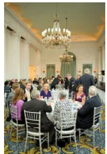
Illinois Section members enjoy their networking and socializing at the awards recognition dinner