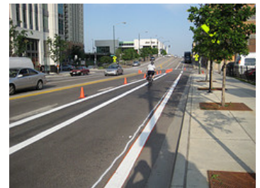
Looking west on Kinsey Avenue from east of North Clinton Street at Chicago's first bicycle track.