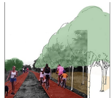
An elevated linear park and multi-use path is planned for the Bloomingdale Trail.