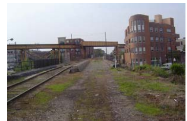
CTA Blue Line over the proposed Bloomingdale Trail near Milwaukee Avenue.

The City continues to pursue funding for the project, while the Trust and Friends are working to raise private funds. The full buildout is expected to cost between $50 million and $70 million, and the project may be phased as funding is made available. About $2.7 million has been secured thus far for phase I design.