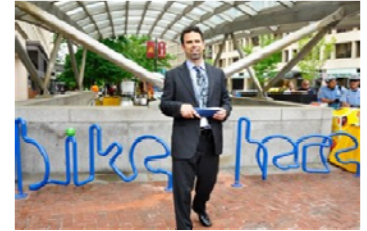
Bicycle friendly and recently Appointed Chicago Department of Transportation Commissioner Gabriel "Gabe" Klein.