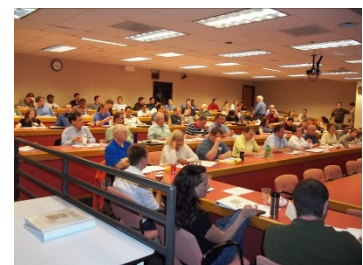
2010 HCM Workshop held at IDOT District One, Schaumburg, IL