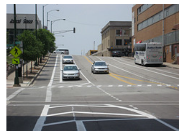
Drivers get the hang of parking adjacent to the new bicycle track on Kinsey Avenue (west of North Jefferson Street).