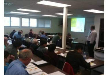
2009 MUTCD Workshop: Dupage County Division of Transportation, Wheaton, IL

The Technical Group is planning many interesting professional development events in the second half of 2010 including regular webinars and a workshop on the new Highway Safety Manual. As always we welcome ideas from the membership on webinar and workshop topics or suggestions to make these professional training events more worthwhile and enjoyable.