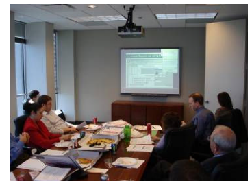
Trip Generation - Advanced Concepts and Application: Jacobs Engineering, Chicago, IL