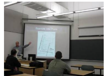
Site Planning is the topic of this presentation organized by the SIUE Student Chapter

The SIUE Student Chapter has big plans for the coming year. This summer, SIUE's enthusiasm for participation will also follow them to the Midwestern ITE Challenge at the District Conference in the Minneapolis, Minnesota, where SIUE will compete for the second time since the Challenge's inception last year.