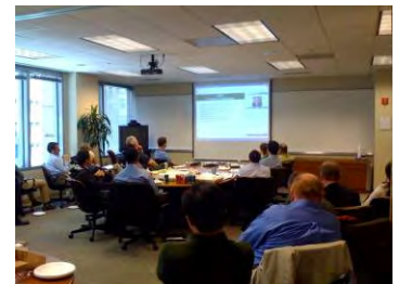
Webinar participants in Chicago intent on discovering solutions to the Challenges of Urban Intersection Design.

Due to the success and overwhelming interest in this webinar, the Illinois Section has plans to host another ITE webinar during the month of July. Details will be released soon.