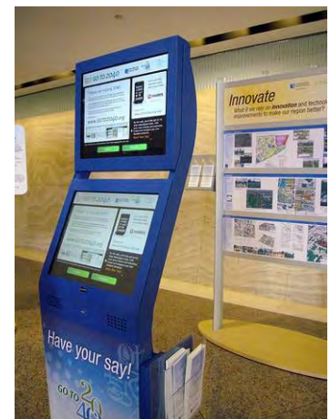
A GO TO 2040 Kiosk in the Sears Tower offers a opportunity for public opinion polling on the shape of the future of the Chicago region.

Besides participating in our interactive workshops across the region, you can also visit a kiosk at particular locations in northeastern Illinois. The Invent the Future kiosks will be traveling around all summer long and you can conveniently check them out when they arrive in your neighborhood. For more information on the GO TO 2040 campaign, including kiosk locations and a schedule of workshops, visit http://www.goto2040.org/default.aspx .