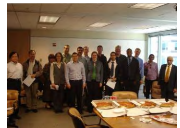
It wasn't all work at the webinar. Chicago participants enjoy networking over pizza.