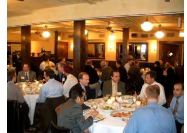
It was a packed house for the March 19 luncheon featuring Illinois Department of Transportation District One Planning and Programming