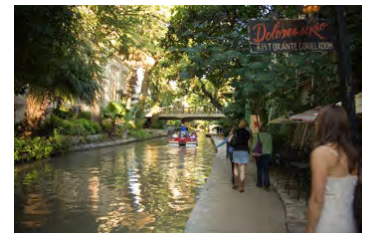
The Riverwalk in San Antonio Texas