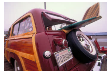
Enjoy the laid back California attitude at the 2008 ITE Annual Meeting and Exhibit in Anaheim.

TRB's National Cooperative Highway Research Program (NCHRP) has issued a request for expressions of interest in participating as a task-order contractor for NCHRP Project 20-65 by submitting a statement of qualifications and availability. The objective of NCHRP Project 20-65 is to provide flexible, ongoing, quick-response research on public transportation issues in support of the American Association of State Highway and Transportation Officials' (AASHTO's) Standing Committee on Public Transportation activities. The research is designed to develop improvements to analytical methods, decision-support tools, procedures, and techniques employed by practitioners addressing public transportation issues. Statements are due July 15, 2008. For more information, visit http://www.trb.org/news/blurb_detail.asp?id=9098 .