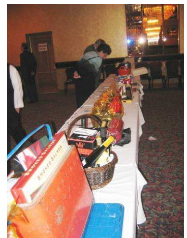
Silent auction items included jewelry, wine/champagne baskets, gourmet food in an "old school cooler", and a chocolate basket, among others