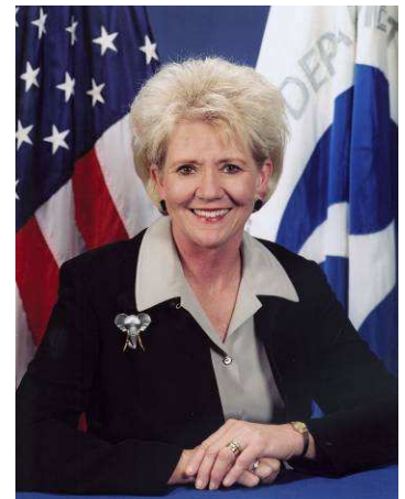
Mary Peters, Secretary, US Department of Transportation

For additional information visit the US DOT website at http://www.dot.gov/ and search for Corridors of the Future using the internal search engine in the upper right corner.