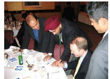
Attendees guess at the meaning of National Park District signs