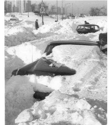
Buried cars at Lake Shore Drive and Foster

From the central city to the farthest suburbs the Chicago region is poised for growth and greatness, bidding for major international events like the Olympics and securing its global reputation as one of the most progressive, vibrant and culturally integrated metropolises in the world. At the heart of this vision is a modern, efficient public transit system that will leverage our economic assets and to help realize our individual dreams and collective hopes in the years and the decades ahead. Today's sound investment yields tomorrow's infinite promise.