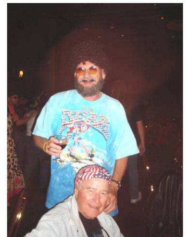
At the Tuesday Night Theme Banquet in Milwaukee. Can you name the District 4 rep? (standing)