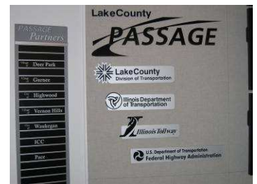
Partners of the Lake County Passage congestion mitigation program are on display at the TMC