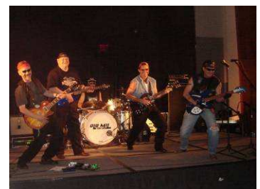
The ITE National Board ROCKS MILWAUKEE!