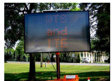
A portable dynamic Message Sign greetings technical tour attendees