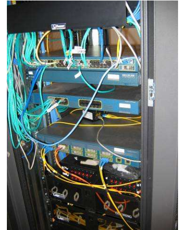
Connectivity is the key at the Lake County Illinois Traffic Management Center