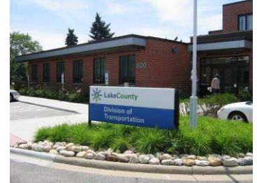
A recent addition to the Lake County DOT admin offices house the TMC

more state- and county-owned signals. Later, the addition of municipally-owned signals to the network provides even wider coverage. PASSAGE is much more than linking traffic signals. Information collected in the field by vehicle sensors (such as the video detection shown in the lower right), highway maintenance and construction personnel, emergency responders and others is analyzed by Advanced Traffic Management System (ATMS) software, which also recommends and helps implement action plans in response. Ultimately, the ATMS will communicate traffic conditions back to highway users in the form of web sites, highway advisory radio (HAR) broadcasts, and variable message signs. HAR is now available in some areas of the county. Lake County PASSAGE gives motorists the opportunity to make better-informed travel decisions and choose alternatives to congested roads. For more information visit www.lakecountypassage.com .