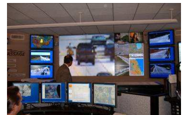
Full screen view and center console displays at the TMC