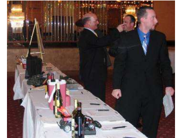
Eat or bid, eat or bid? Attendees assess their priorities (and wallets!) at the silent auction tables.

Earl mentioned that 2005 was first year there was a membership decline (about 1%). Perhaps the $250 dues are too expensive for younger members. ITE National is considering a 3-year step-in to full dues for recent graduates.