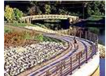
Silver Creek Bike Path in Rochester Minnesota, host of the 2006 ITE District 4 Conference.