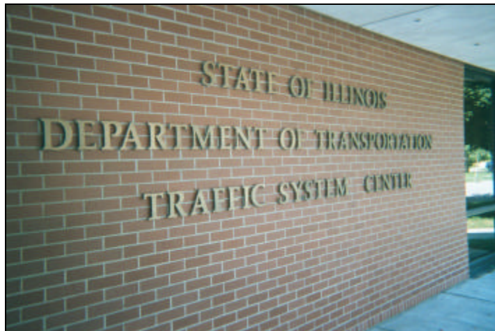
IDOT Traffic System Center (TSC)

The Minutemen provide about 100,000 expressway motorist assists each year. Some 22% are lane blocking incidents. Clearance times average 9 minutes for a shoulder incident, 12 minutes for incidents blocking one lane and 22 minutes for two lanes. The fleet of 35 patrol trucks has now been completely upgraded with the advanced technology, hands-free vehicle relocation units. Operator safety had been greatly improved; and, incident clearance duration has been reduced. An effort to develop an ETP vehicle location capability using global positioning and existing infrastructure and computer capabilities is currently underway.