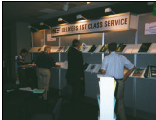
ITE Technical Services Display

The Illinois Section was the host section for the August 19-22, 2001 meeting at the Hyatt Regency. Our Local Arrangements Committee made the event a Transportation Odyssey with many opportunities for each ITE member to: expand knowledge of transportation topics; build a professional network; investigate vendor products and services.